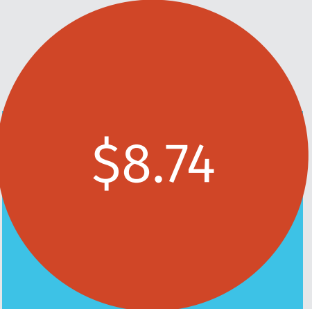
Average payroll deduction per employee

Logix employees make voluntary contributions to sponsored charities via payroll deductions through Community Stars' Contributions Program and special fund-raising events. Logix also offers a donation-matching program for employees who participate in this program.