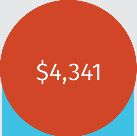
Average number of dollars contributed per pay period