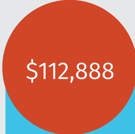
Total dollars donated by employees via payroll deduction