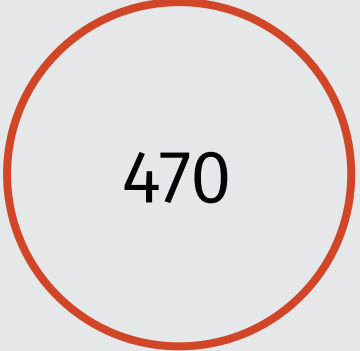
Number of employees contributing via payroll deduction