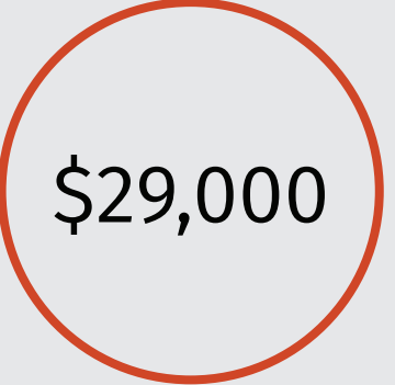
Donation matching from Logix